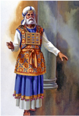
Eleazar with Ephod with Urim

Nu 12:6-8+ He (YAHWEH) said, "Hear now My words: If there is a prophet among you, I, the LORD, shall make Myself known to him in a vision. I shall speak with him in a dream. 7 "Not so, with My servant Moses, He is faithful in all My household; 8 With him I speak mouth to mouth, Even openly, and not in dark sayings, And he beholds the form of the LORD. Why then were you not afraid To speak against My servant, against Moses?"